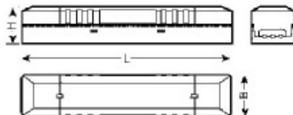
Product line drawing - technical