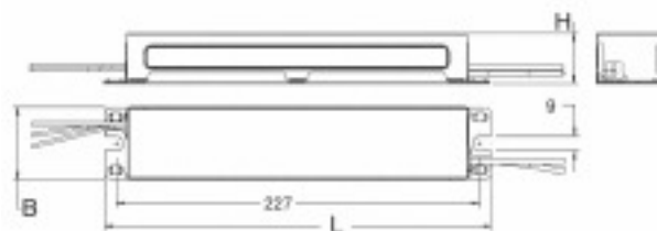
Product line drawing - technical